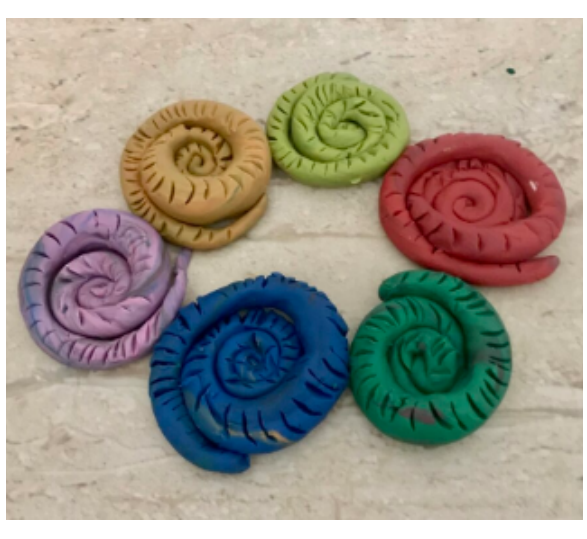
Eden, age 5