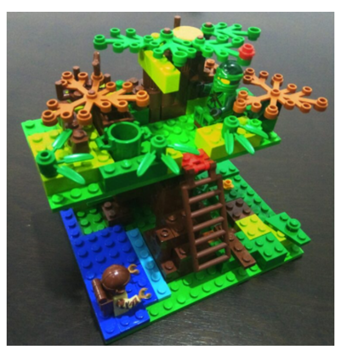
Colin, age 10