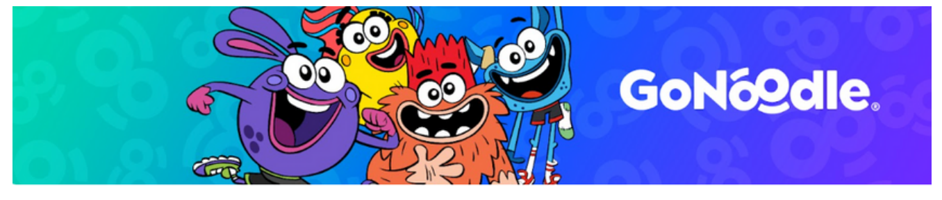
Wolsey Hall is not affiliated with this website.

GoNoodle started their Good Energy Movement that encourages children all around the world to tunnel their energy into positive and mindful exercise. With over 14 million regular viewers, GoNoodle creates exercise videos that incorporate movement in dance routines, challenges, and even Science lessons. On top of that, the platform regularly publishes themed blog posts with details on how to turn daily activities such as tidying up, cooking and eating snacks, into physical play.